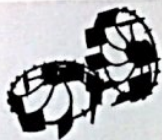
SWAMP IRON WHEEL