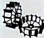
CAGE WHEEL SPECIAL